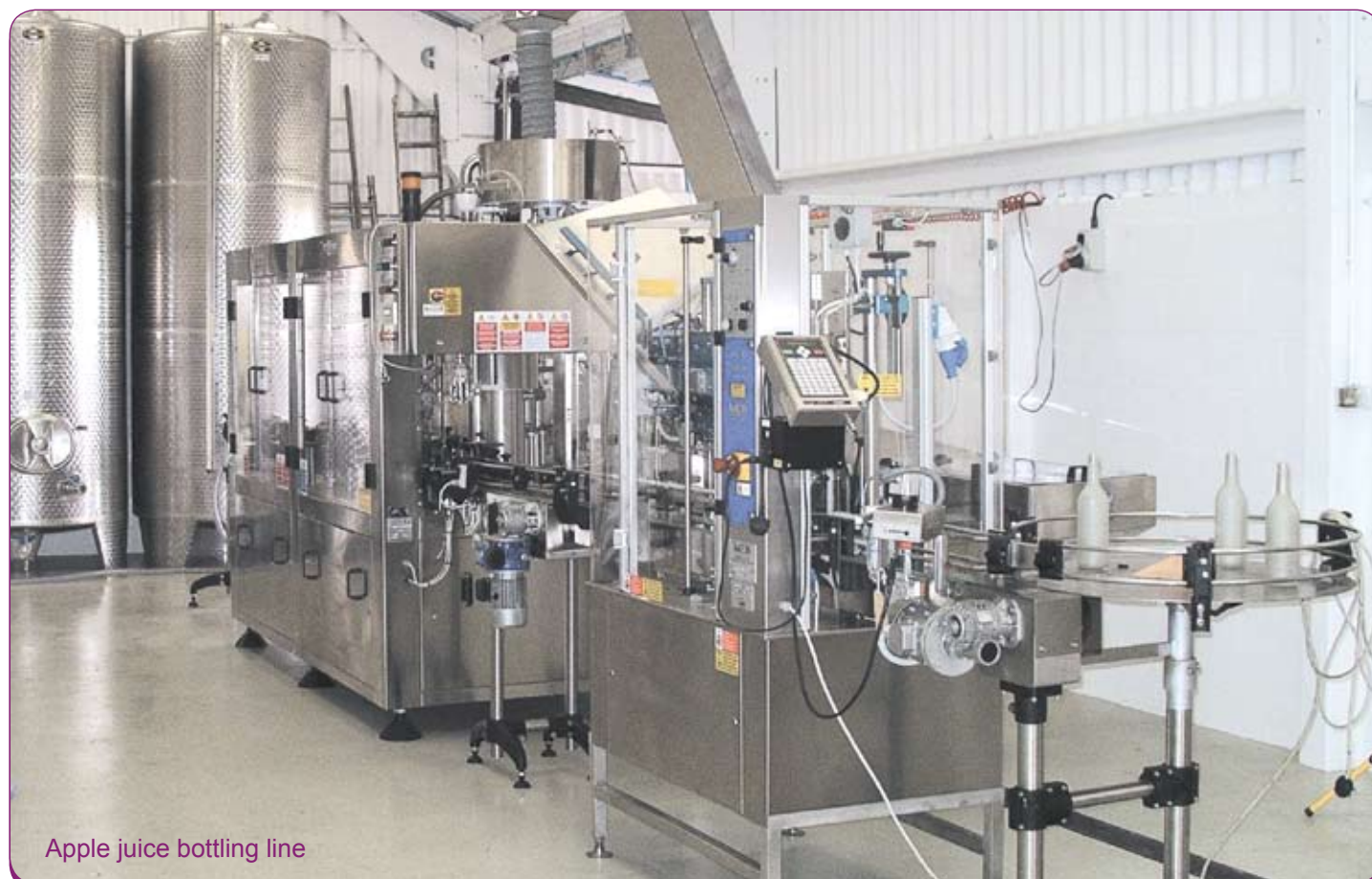
Apple juice bottling line