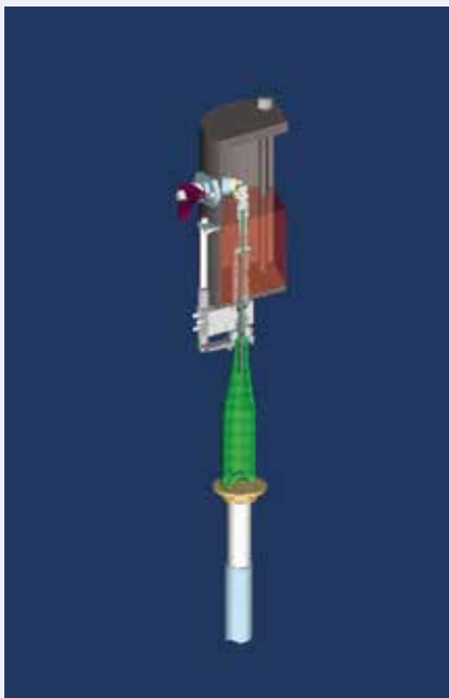
DPS Valve with 'Low oxygen pick-up'