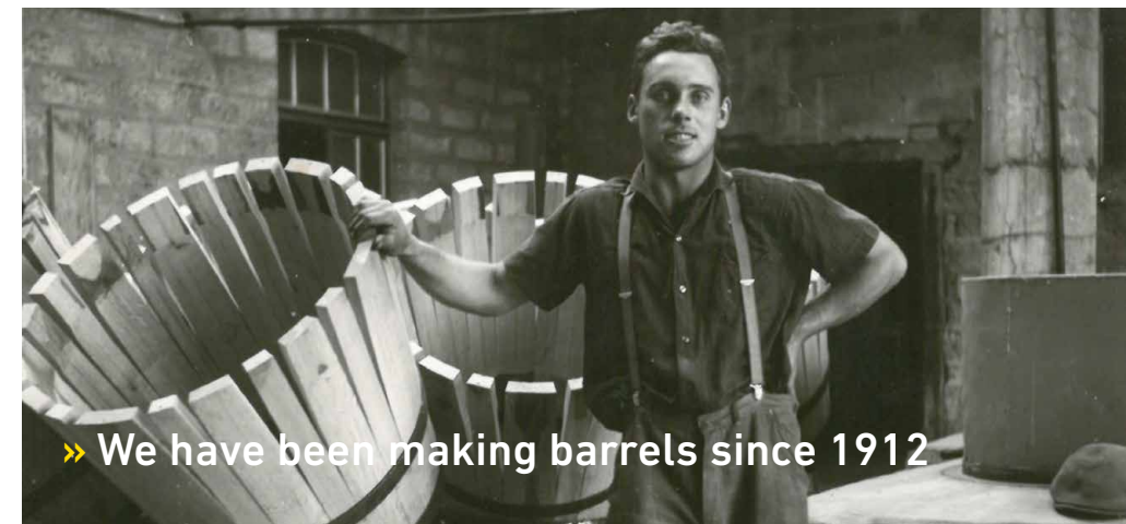
» We have been making barrels since 1912

From our decades of experience we know what is important. From product development and consulting through to delivery on our own fleet of trucks you will receive everything from one source Made in Germany.