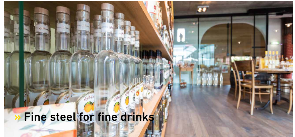
» Fine steel for fine drinks